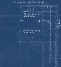
DETAIL OF TILE FLOORS IN CHURCH VESTIBULE

NOTE: All surfaces above the ground line are shown in perspective. Figures in circles of points at 1/2 inch and 1/4 inch.